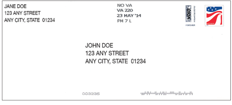
Figures 1, 2, and 3 Sample Postmarks (Images not to scale)

In recognition of the importance that the election laws in some states place on postmarks, it has been the long-standing policy of the Postal Service to try to ensure that every return ballot mailed by voters receives a postmark, whether the return ballot is mailed with postage pre-paid by election officials or with a stamp affixed by the voter. A voter can ensure that a postmark is applied to his or her return ballot by visiting a Postal Service retail office and requesting a postmark from a retail associate when dropping off the ballot.