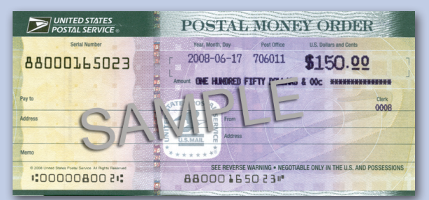
Point of Service (POS) Money Order

U.S. Postal Service<sup>™</sup> money orders are among the most secure financial instruments in the world. Genuine U.S. Postal Service money orders contain design features that maximize their security.