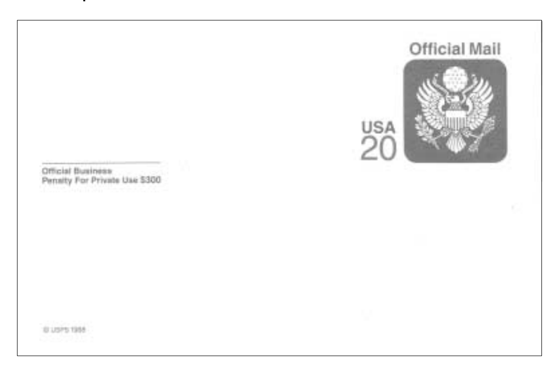
Exhibit 2 PMS Stamped Card