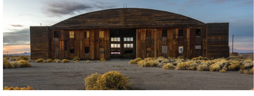
Above: Abandoned World War II Air Force hangar among a field of sagebrush, Tonopah.