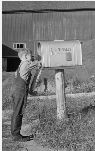
Kirby, Vermont, 1937

Specifications for the No. 2 rural mailbox were approved by the Postmaster General on November 1, 1928.