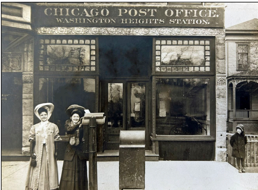
Washington Heights Station, Chicago, Illinois, circa 1900

In the 1890s the Post Office Department favored consolidating smaller, suburban Post Offices with larger ones to provide more customers with free delivery, to streamline and modernize management, and to bring more employees into the classified civil service. 8 In July 1894, the delivery area of the Chicago Post Office almost doubled — providing service to nearly 97 percent of the city's inhabitants — when 59 independent Post Offices "within the confines of Chicago" were consolidated with the Chicago Post Office. 9 Most of the discontinued Post Offices were converted to stations, often superintended by their former postmasters. The stations provided identical service to customers but were administratively subordinate to the Chicago Post Office.