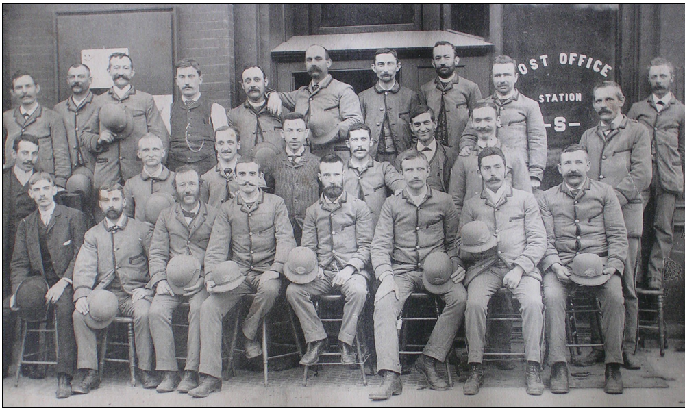
Employees of Station S, Brooklyn, New York, Post Office, in 1888

Station S, established in 1885, was renamed Bushwick in 1947. It still serves Brooklyn residents.