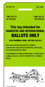
Sample of Tag 191 (images not to scale).