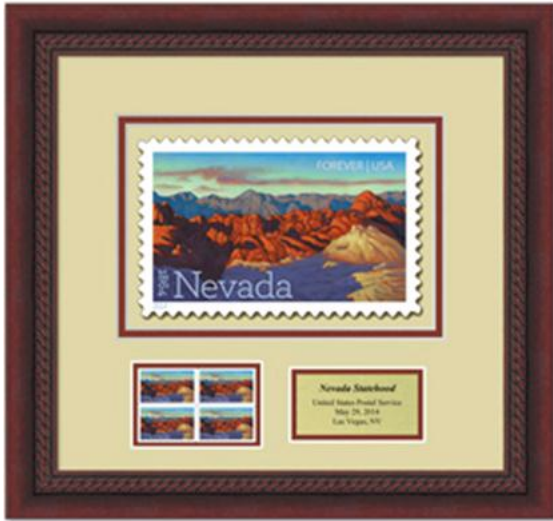
472224, Framed Art , $39.95.