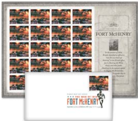
588208, Press Sheet w/o Die cuts , $49 (print quantity 1,500).