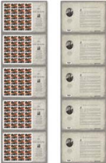
588206, Press Sheet w/Die cuts , $49 (print quantity 1,000).