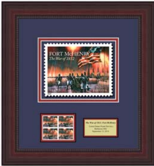
588224, Framed Art , $39.95.

Eleven philatelic products are available for this stamp issue: