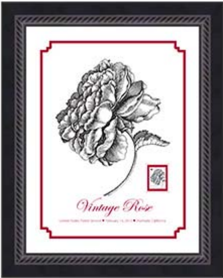
587724, Framed Art , $29.95.