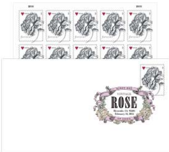
587710, Digital Color Postmark Keepsake , $11.95.