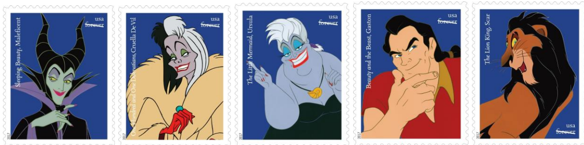
From left: Maleficent ( Sleeping Beauty ), Cruella De Vil ( One Hundred and One Dalmatians ), Ursula ( The Little Mermaid ), Gaston ( Beauty and the Beast ) and Scar ( The Lion King ).

The words “USA” and “Forever” appear in the top right corner or bottom right corner of each stamp and the name of the classic villain and the movie in which the character appears runs along the left edge.