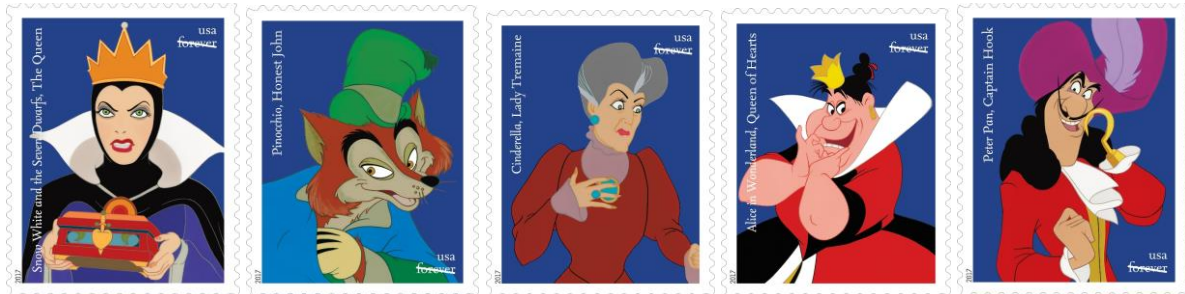
From left: the Queen ( Snow White and the Seven Dwarfs ), Honest John ( Pinocchio ), Lady Tremaine ( Cinderella ), the Queen of Hearts ( Alice in Wonderland ) and Captain Hook ( Peter Pan ),

Each stamp showcases one of 10 classic Disney villains against a blue background.