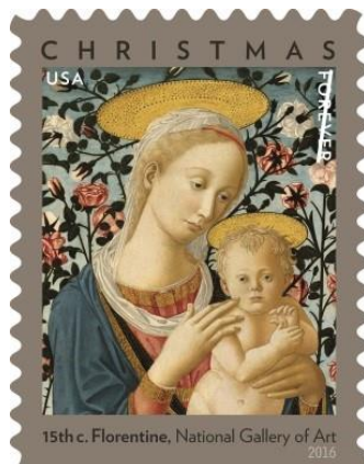
Florentine Madonna and Child (2016)