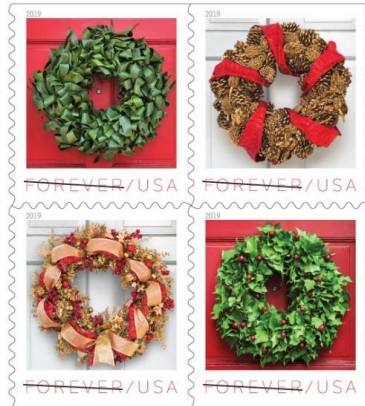
Holiday Wreaths (2019)