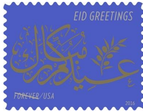
Eid Greetings (2016)