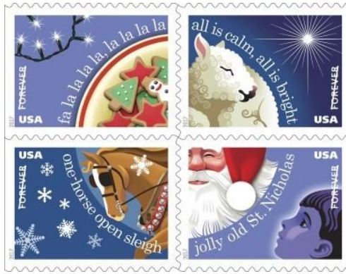
Christmas Carols (2017)