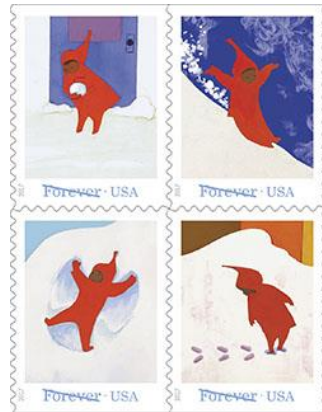
The Snowy Day (2017)