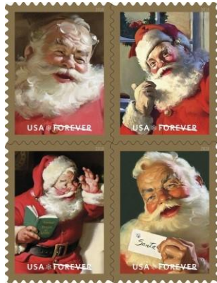
Sparkling Holidays (2018)