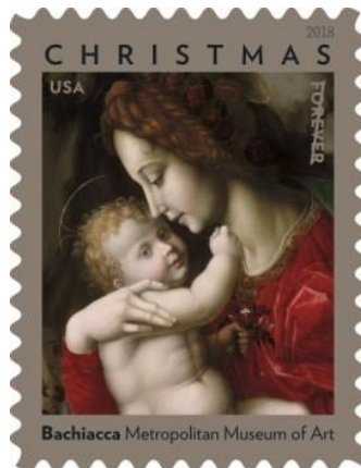
"Madonna and Child" by Bachiacca (2018)