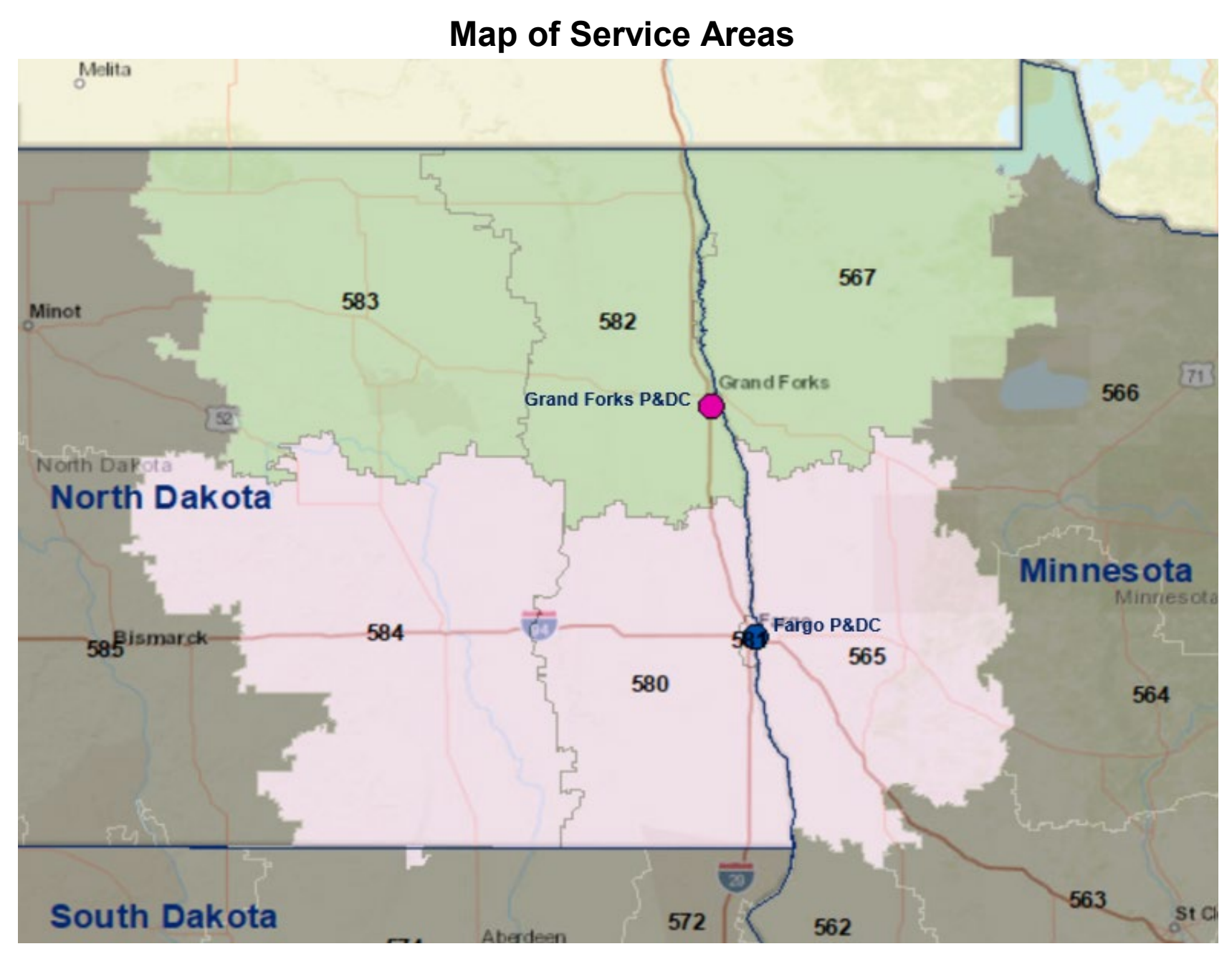
567, 582-583 Grand Forks