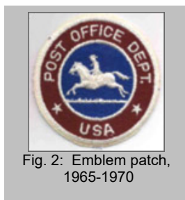
Fig. 2: Emblem patch, 1965-1970