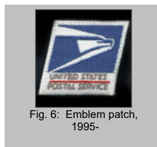
Fig. 6: Emblem patch, 1995-

The uniform emblem patch was authorized by Postmaster General Arthur E. Summerfield in December 1955. The new uniforms with patches were available from uniform manufacturers beginning on January 15, 1956, but were not required wear until April 21, 1957. The three-inch circular patches with the "backward" (facing right) horse and rider were to be worn on the left sleeves of shirts and coats. The 1957 Personnel Handbook provided the following construction details: