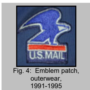
Fig. 4: Emblem patch, outerwear, 1991-1995