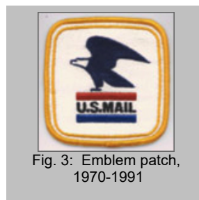
Fig. 3: Emblem patch, 1970-1991