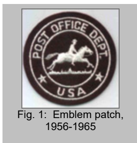
Fig. 1: Emblem patch, 1956-1965