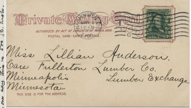
View "Private Mailing Card" with Undivided Back, Mailed 1905