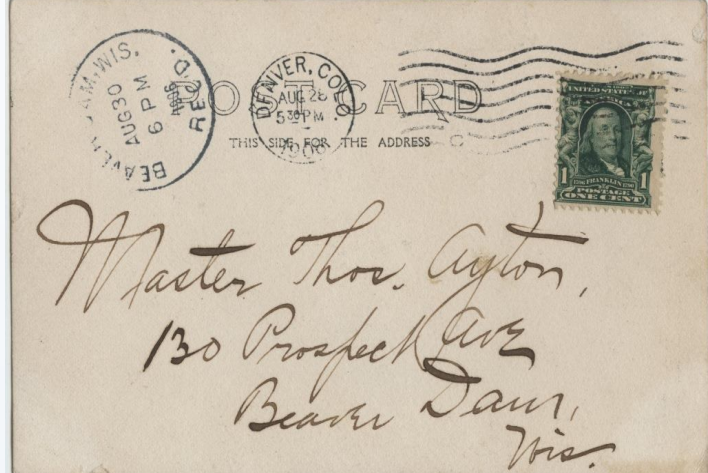
Real Photo Postcard, Mailed 1906