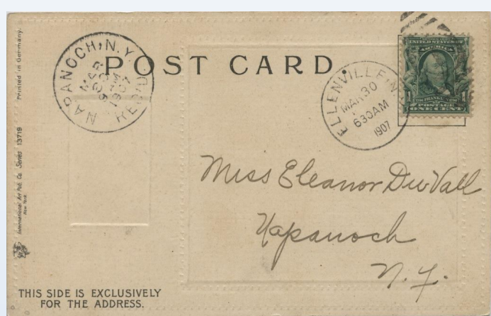
Holiday Postcard with Undivided Back, Mailed 1907