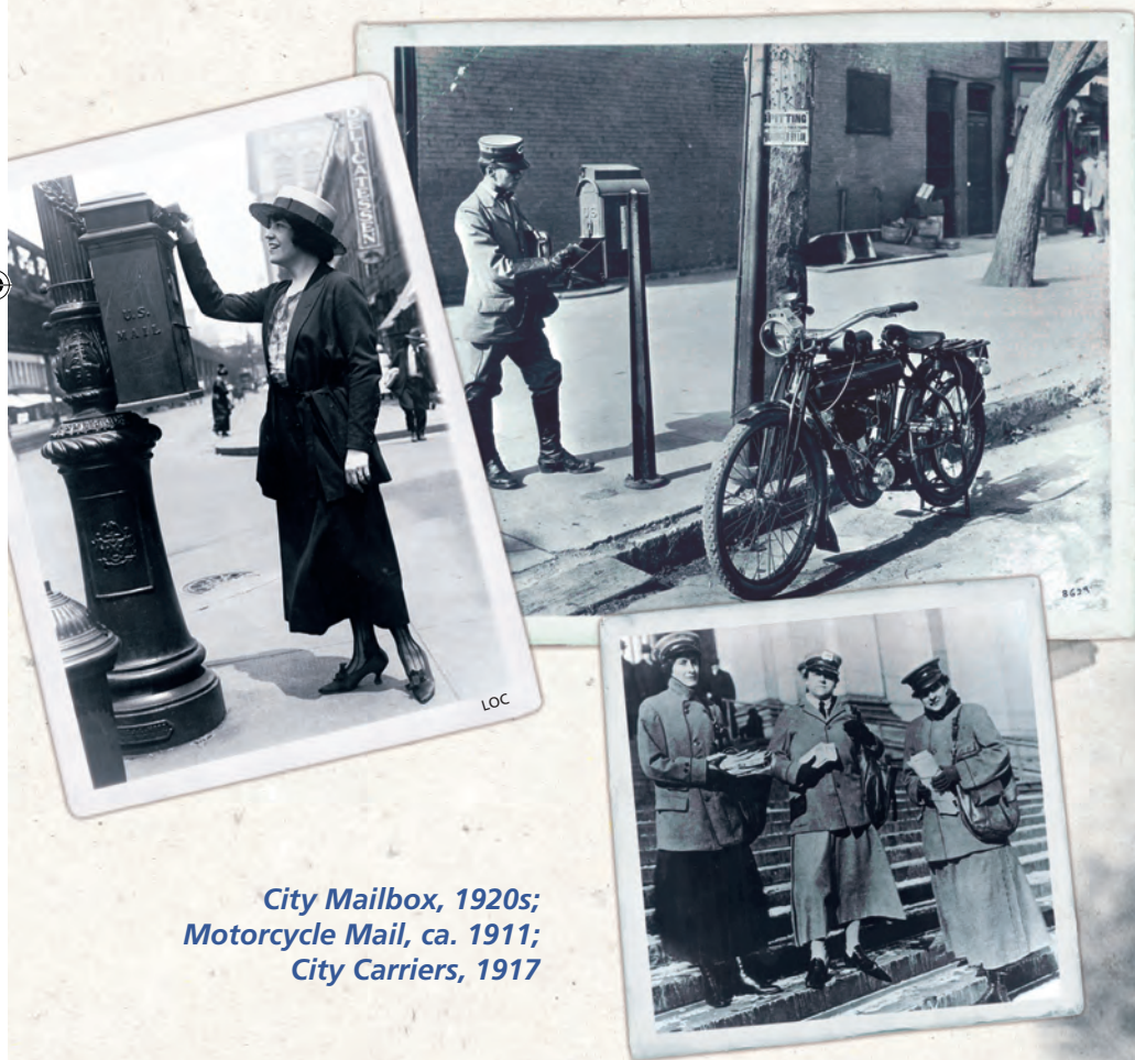
City Mailbox, 1920s; Motorcycle Mail, ca. 1911; City Carriers, 1917

Free home delivery in the countryside — called “rural free delivery” or RFD — began experimentally in 1896 at a few offices in West Virginia; within a year, routes were operating in 29 states. The popular service was made permanent in 1902. The