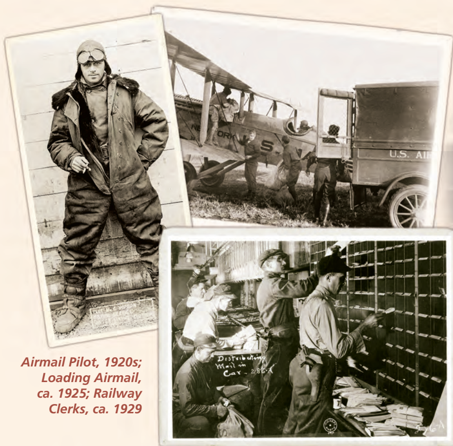
Airmail Pilot, 1920s; Loading Airmail, ca. 1925; Railway Clerks, ca. 1929

Mail aboard trains not only traveled faster — it traveled smarter. An army of postal workers called “railway mail clerks” rode the rails in specially equipped cars called Railway Post Offices. From 1864 to 1977, railway mail clerks expedited delivery by sorting mail en route as it rumbled to its destination. To save even more time, clerks exchanged mail at smaller Post Offices “on the fly” without the train stopping. Clerks would toss out one pouch of mail and, seconds later, scoop up another pouch — filled