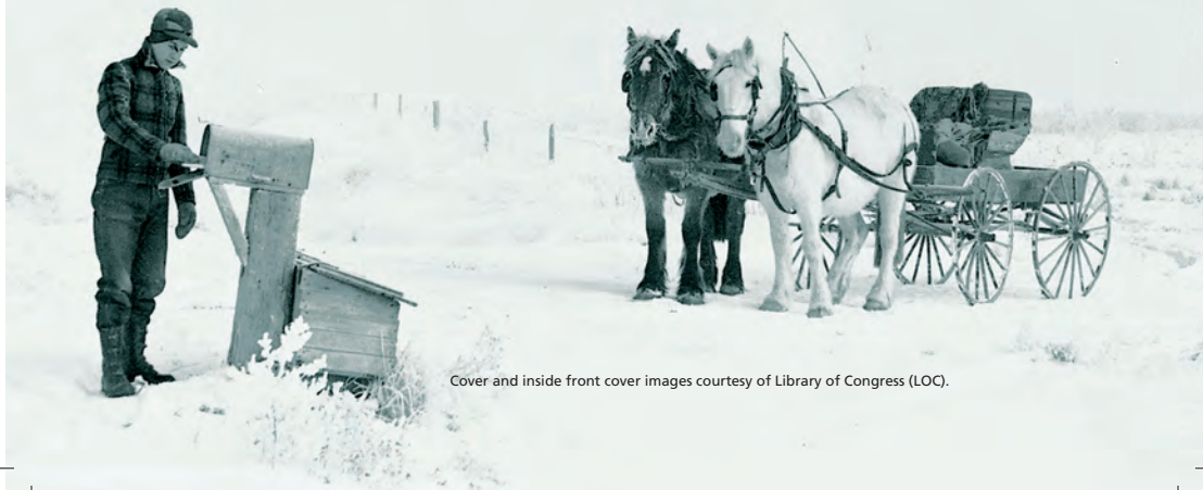
Cover and inside front cover images courtesy of Library of Congress (LOC).