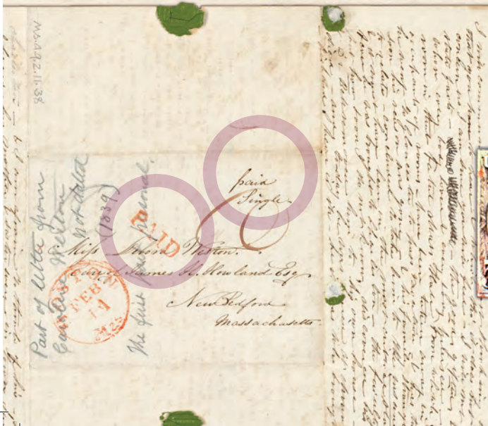
Letter marked “PAID,” 1839; Franklin and Washington stamps, 1847; Elvis stamp, 1993